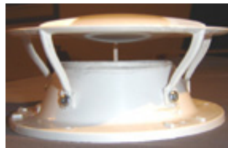
Cap # 3