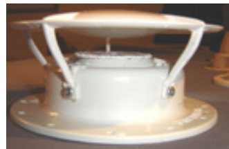
Cap # 1