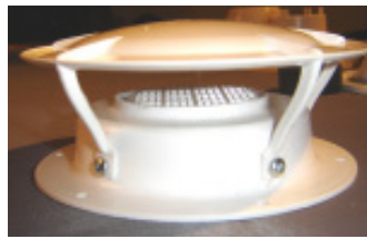
Cap # 2